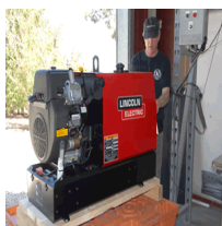
MAG2000gw™ cutting and welding system with DC welding power source.