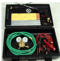
MAG2000+™ flame and arc cutting system with battery ignition.