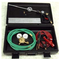
MAG4000™ Flame cutting system with 15 feet of battery ignition.