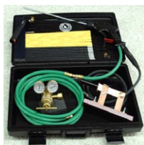
MAG2000X™ underwater cutting system with knife switch for ignition.