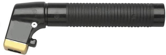
400 amp welding stinger handle to weld materials after they are cut. Displays alligator jaws for precise lock on the welding electrode.