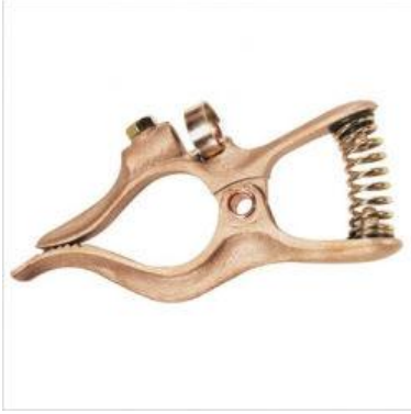
Professional ground clamp.