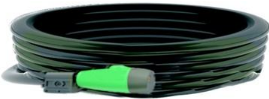
50' of high grade welding cable with suitable connectors.