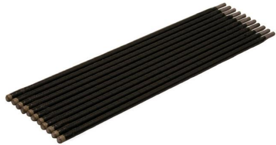
Complimentary welding electrodes for mild steel are wrapped and dipped for years of shelf life.